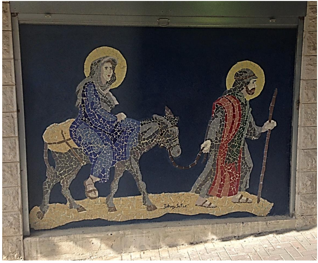
A Mosaic of Mary & Joseph in Bethlehem